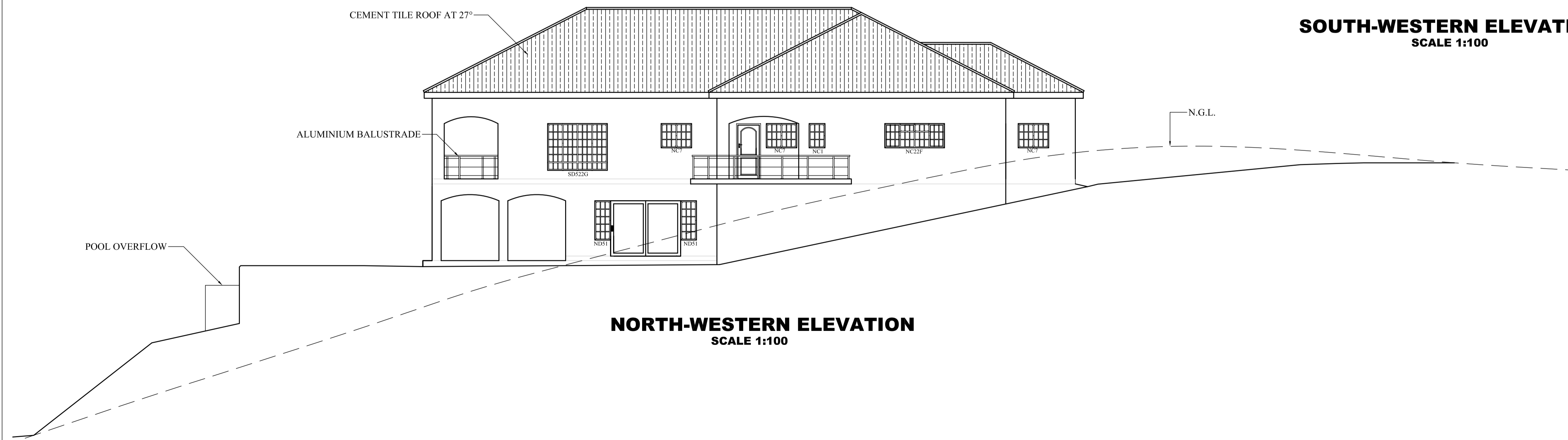
NORTH-WESTERN ELEVATION SCALE 1:100

PLEASE NOTE: This drawing is the property of RUDI DORFLING and is furnished on the expressed understanding that no part of it shall be reproduced, copied, lent, or disposed of to others, directly or indirectly, nor used for any purpose other than that for which it is specifically issued.