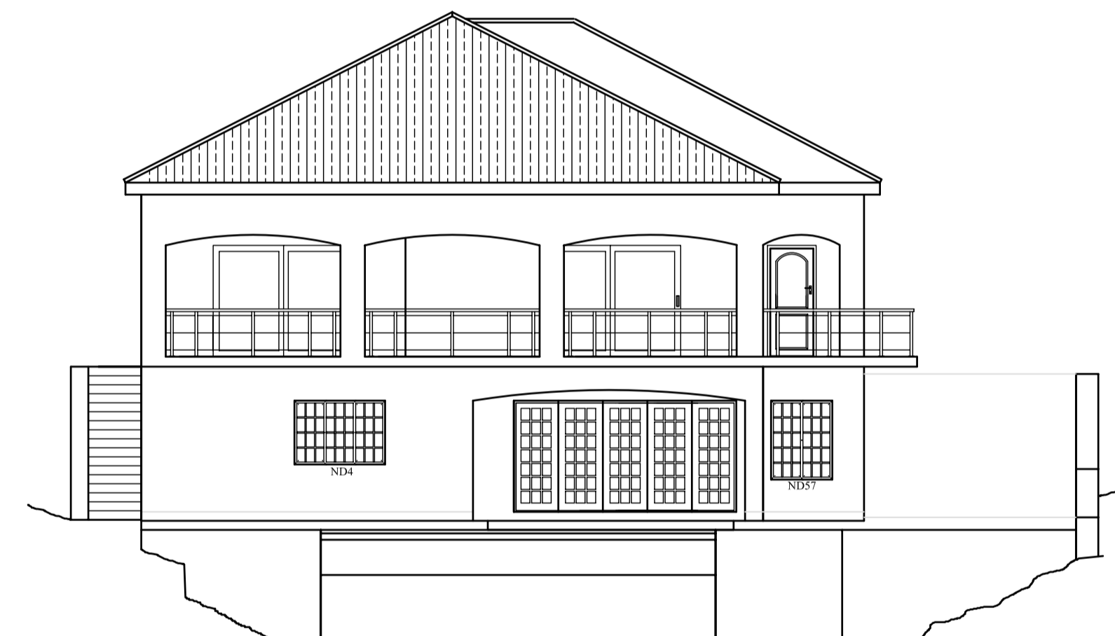
SOUTH-WESTERN ELEVATION SCALE 1:100